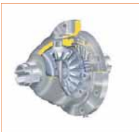
Limited-slip differential FAM