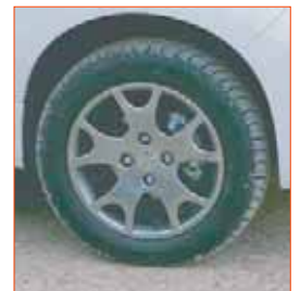
All-road tires (option)