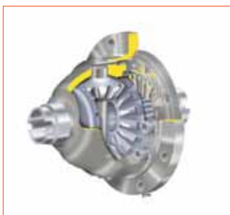
FAM limited-slip differential